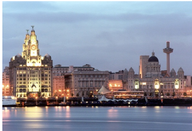
Liverpool Medical Institute, Liverpool

Thursday 10 th & Friday 11 th November 2016